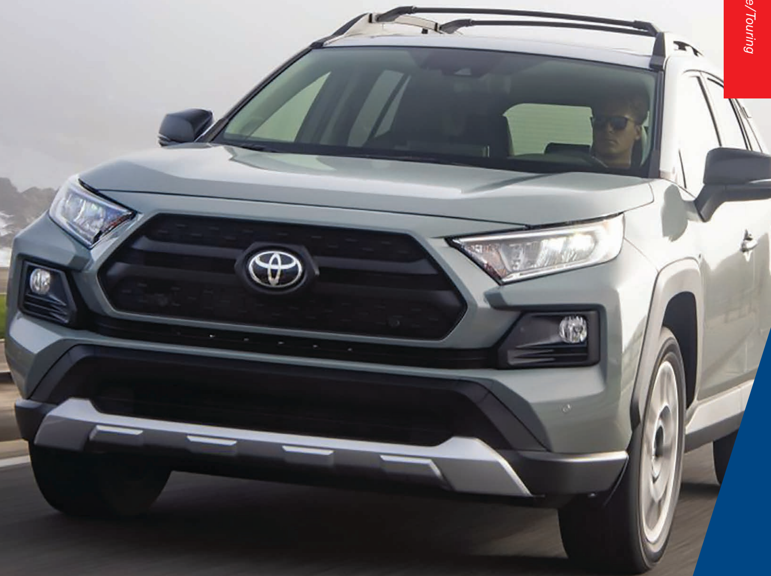
Experienced driver depicted.