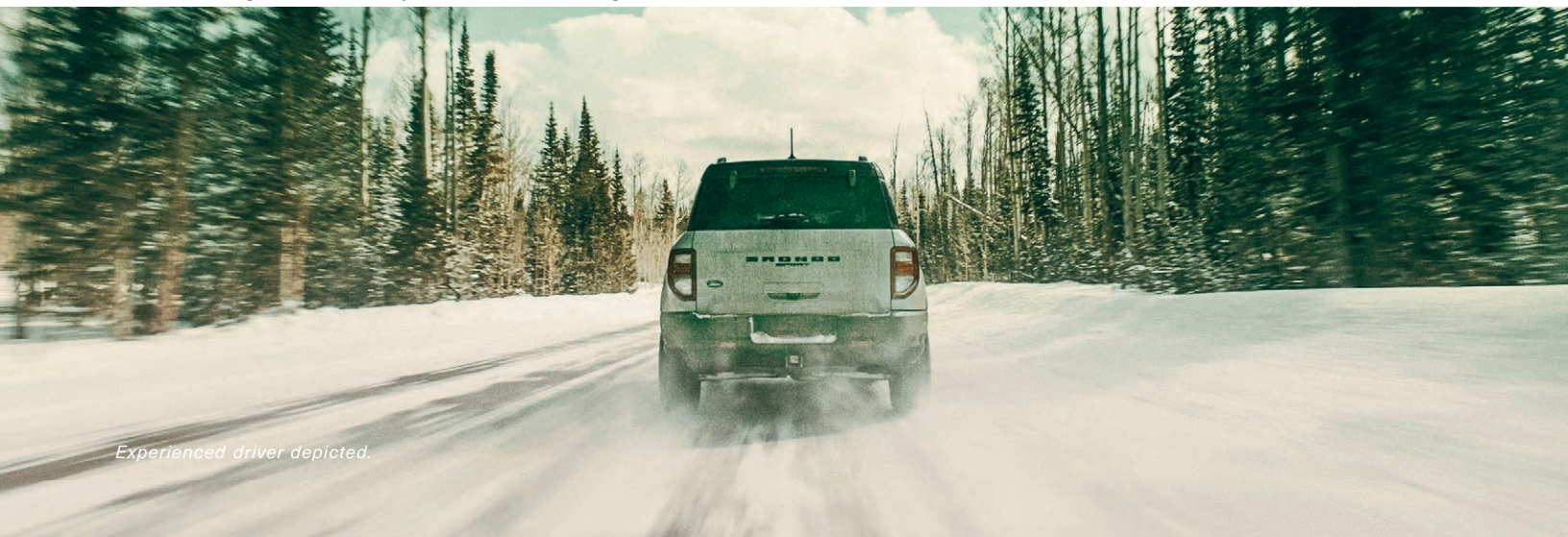
Experienced driver depicted.