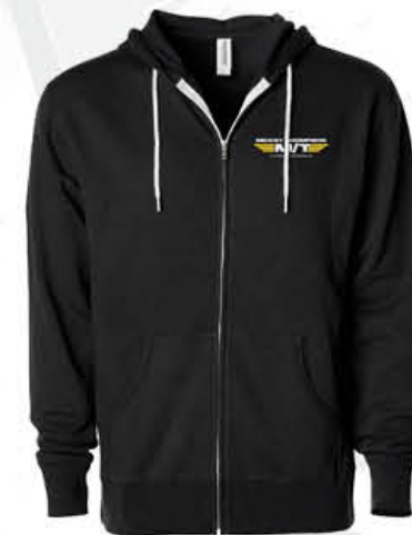
MT LOGO ZIP-UP HOODIE