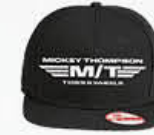
MT LOGO NEW ERA SNAPBACK CAP

FOR MORE APPAREL/GEAR VISIT MICKEYTHOMPSONPROMO.COM