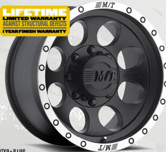
17X9 • 8 LUG

LIFETIME LIMITED WARRANTY AGAINST STRUCTURAL DEFECTS 1 YEAR FINISH WARRANTY