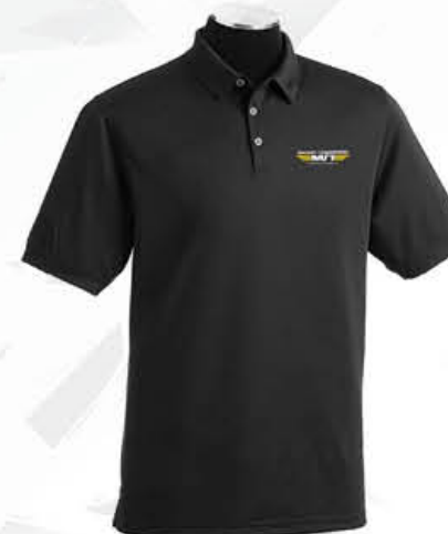
MT LOGO POLO