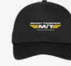
MT COLOR LOGO FLEXFIT CAP