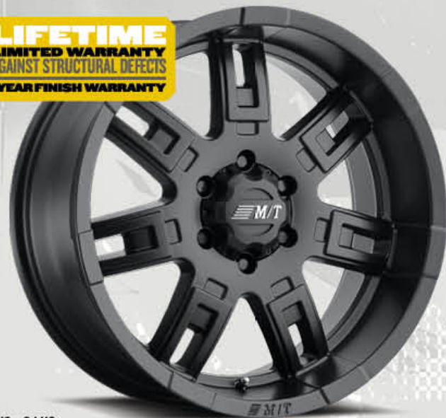
20X9 • 6 LUG

LIFETIME LIMITED WARRANTY AGAINST STRUCTURAL DEFECTS 1 YEAR FINISH WARRANTY