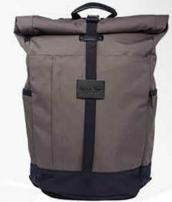
MT LOGO ROLL-TOP BACKPACK