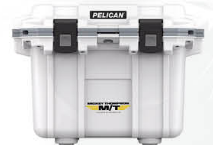
MT LOGO PELICAN 30QT COOLER