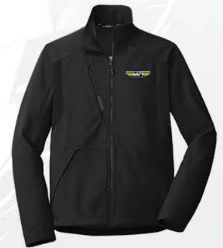
MT LOGO SOFTSHELL JACKET